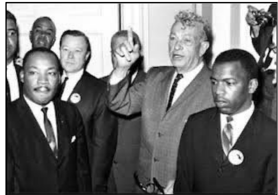
This photo will be made into a canvas to be hung on the side of the Library building, thanks in part to a gift from the Friends of Pekin Public Library